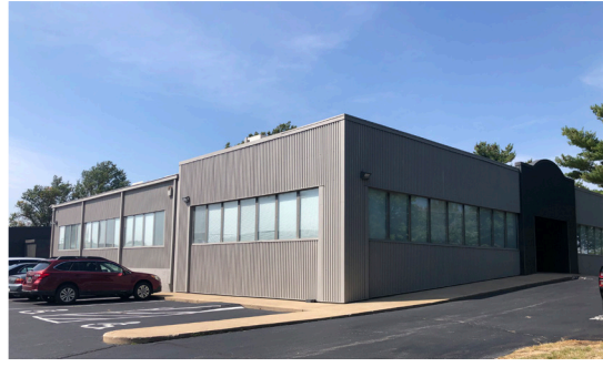
Front of Building Floor Plan